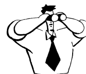
Searching for Emmaus Team Manuals.

And once again, thank you for serving on an Emmaus Team!