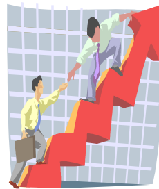
A Christian Milestone to me, what does it mean to you?

But, the question above asks, "What does The Walk to Emmaus mean to YOU ?" Although it is likely that each of you would answer the question in a similar manner, every individual had an experience unique to you alone.